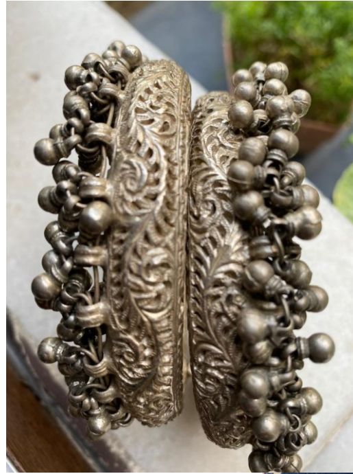
Double silver bangle