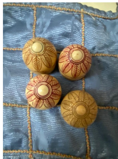
Ivory hand painted chopar discs